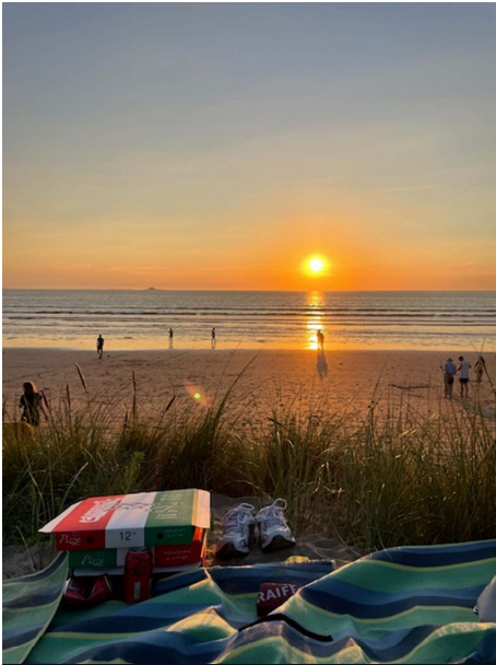
sunset at the Banna Beach