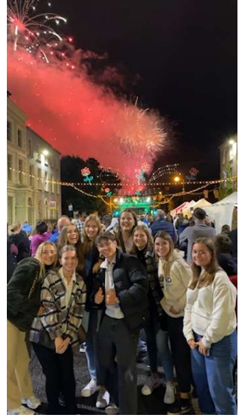
Rose of Tralee