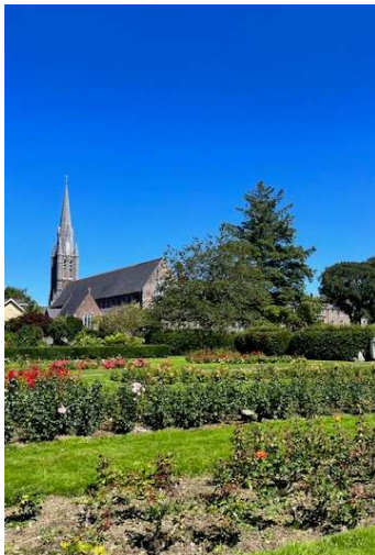
city park Tralee

Furthermore, I'd really like to tell you about my weekends and my hobbies. In the first week I bought the fitness subscription. The gym is very big and there aren't a lot of people. I mean mostly, it depends on the time and on the day. So, if you should ever look for me, you will probably find me in the gym.