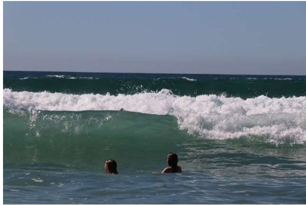
wavy Banna Beach