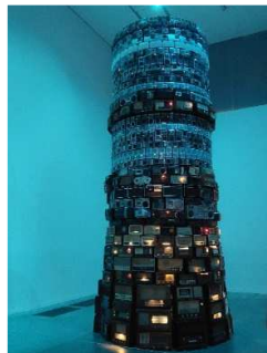
The Tate Modern Museum