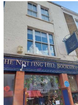
Notting Hill Bookshop One among many ...