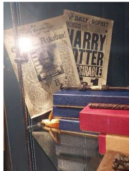
Harry Potter Shop at Kings Cross Station