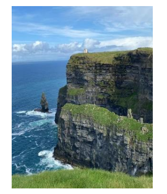
Cliffs of Moher Stunning views, definitely worth visiting :)