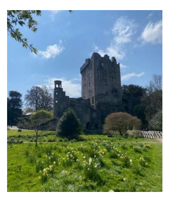
Blarney Castle Kissing the Blarney stone brings you good luck!